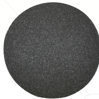
BOTTOM OF SILENCER PAD