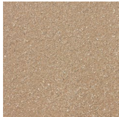
1107 | Latte