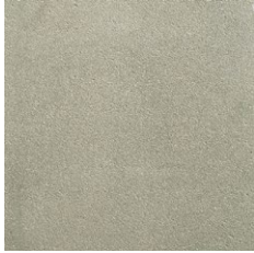
1101 | Natural

Shot blast is the standard finish for Western pavers. Matte finish is special order and will require extended lead time.