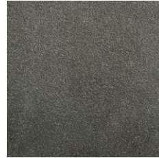
1104 | Charcoal