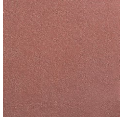
1102 | Red