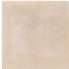
1109 | Yellow*