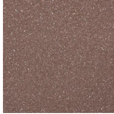
1103 | Cinnamon