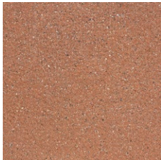
1105 | Ginger