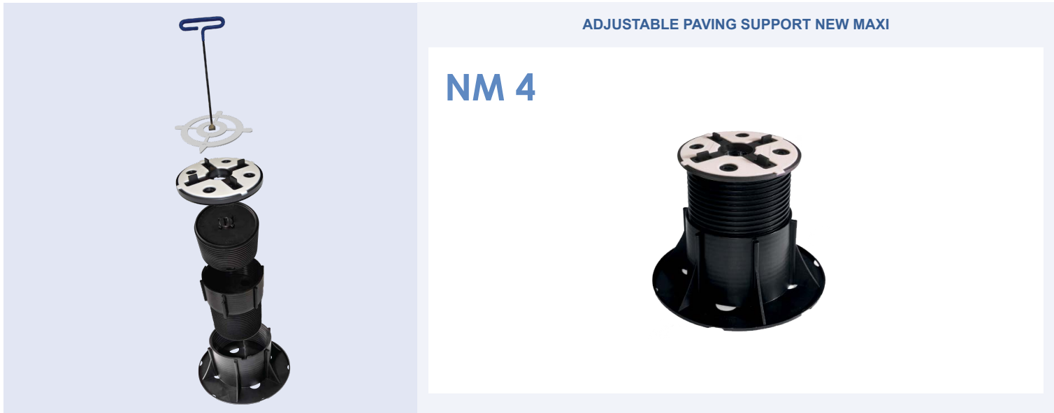
ADJUSTABLE PAVING SUPPORT NEW MAXI