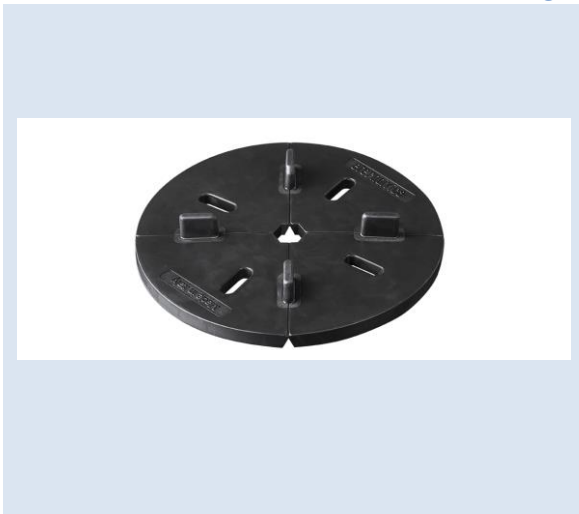
EH RUBBER PAD 1/4"